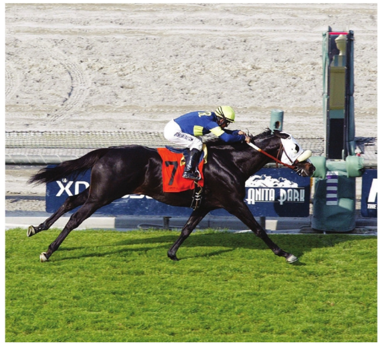
Bright Thought set a world record time when winning the G2 San Luis Rey Stakes at Sants Anita last month